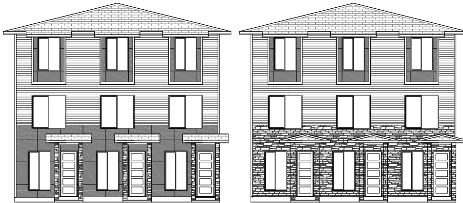
ELEVATION OPTION A

CALL FOR A FREE BUILDING SITE CONSULTATION!